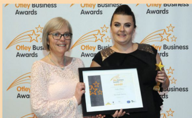
Best Small Business – Puffin Pottery Sponsor – Althams Travel