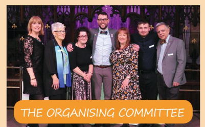
THE ORGANISING COMMITTEE