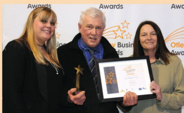
Best Retail – Geo Middlemiss & Son Sponsor – Rest Assured Homecare