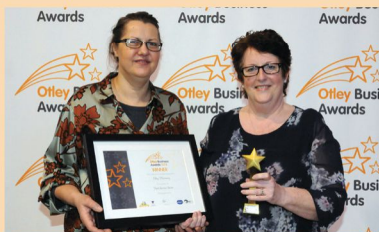
Best Service Sector – Otley Pharmacy Sponsor – Bondgate Bakery