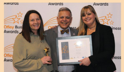
Best Employer – Rest Assured Homecare Sponsor – Print Crew