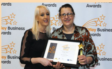
Best Large Business – Bondgate Bakery Sponsor – O'Deli