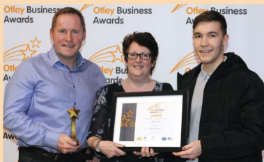
Best Newcomer – Apollo 3D Sponsor – Otley Pharmacy