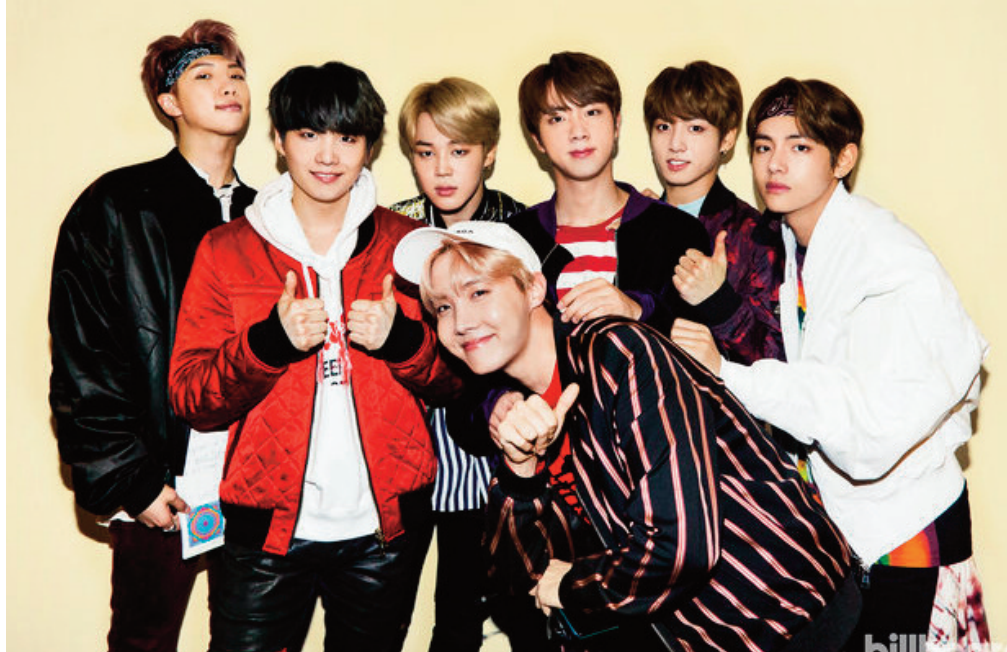
CHART TOPPERS: Korean boy band BTS sporting a range of two-block mens' hair cuts