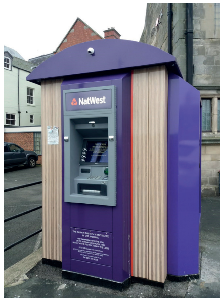
freestanding cash point in Whitby

Lighting scheme - will be extended to 50 lighting column motifs along Otley's main thoroughfares, while several areas of the town that were previously unlit at Christmas will benefit from the addition of festive lighting this year www.otleytowncouncil.gov.uk/ and www.otleybid.co.uk/