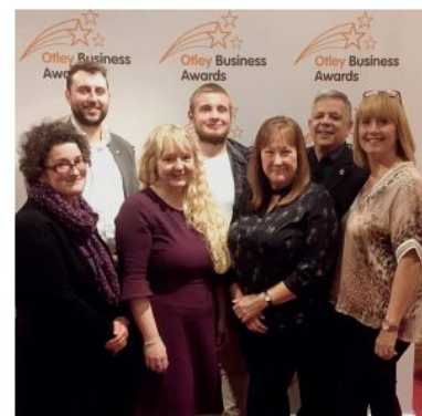
Otley Business Awards Committee

The next edition of the Otley Economic Bulletin will list all the nominees in each category so we hope to see your favourite business listed there.