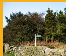
The Great Outdoors