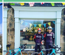
Otley Cycling Hub