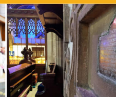
History & Heritage